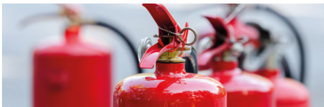
Fig. 1: Pressure vessels in fire extinguishers

Pressure vessels hold gases or liquids at a pressure higher than atmospheric one. They are found in fire extinguishers as well as in avalanche airbags. In order to save weight, the wall thickness of pressure vessels is becoming smaller and smaller and thus more susceptible to cracking. Since a crack in the material can cause the container to burst and have catastrophic consequences, the pressure vessels are subject to the highest safety and quality requirements. FOERSTER supports quality control with non-destructive eddy current testing systems. These inspect the pressure vessels directly in the production process for surface defects such as cracks.