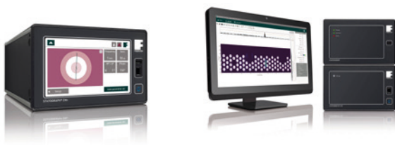
Fig. 2: STATOGRAPH CM+ & STATOVISION

The STATOGRAPH CM+ testing system is used in conjunction with a high-resolution eddy current probe for crack testing of the pressure vessels. Surface defects such as cracks disturb the uniform propagation of eddy currents in the material. These irregularities are detected by the probe and displayed as a signal. In addition, the surface can be displayed as a scan image by using the STATOVISION software.